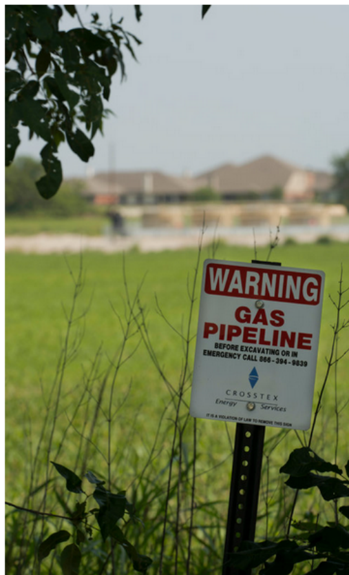
A gas well sits about 400 feet from a Denton home, whose resident complained of fumes.

Texas law says the state intends its mineral resources to be “fully and effectively exploited,” but courts have said the power is not absolute. The Railroad Commission has jurisdiction over all oil and gas wells in the state, with authority to adopt “all necessary rules for governing and regulating persons